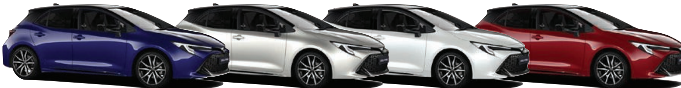
Juniper Blue Bi-tone (2VL)