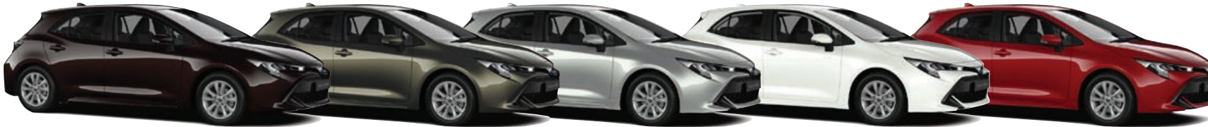
Phantom Brown (4W9)