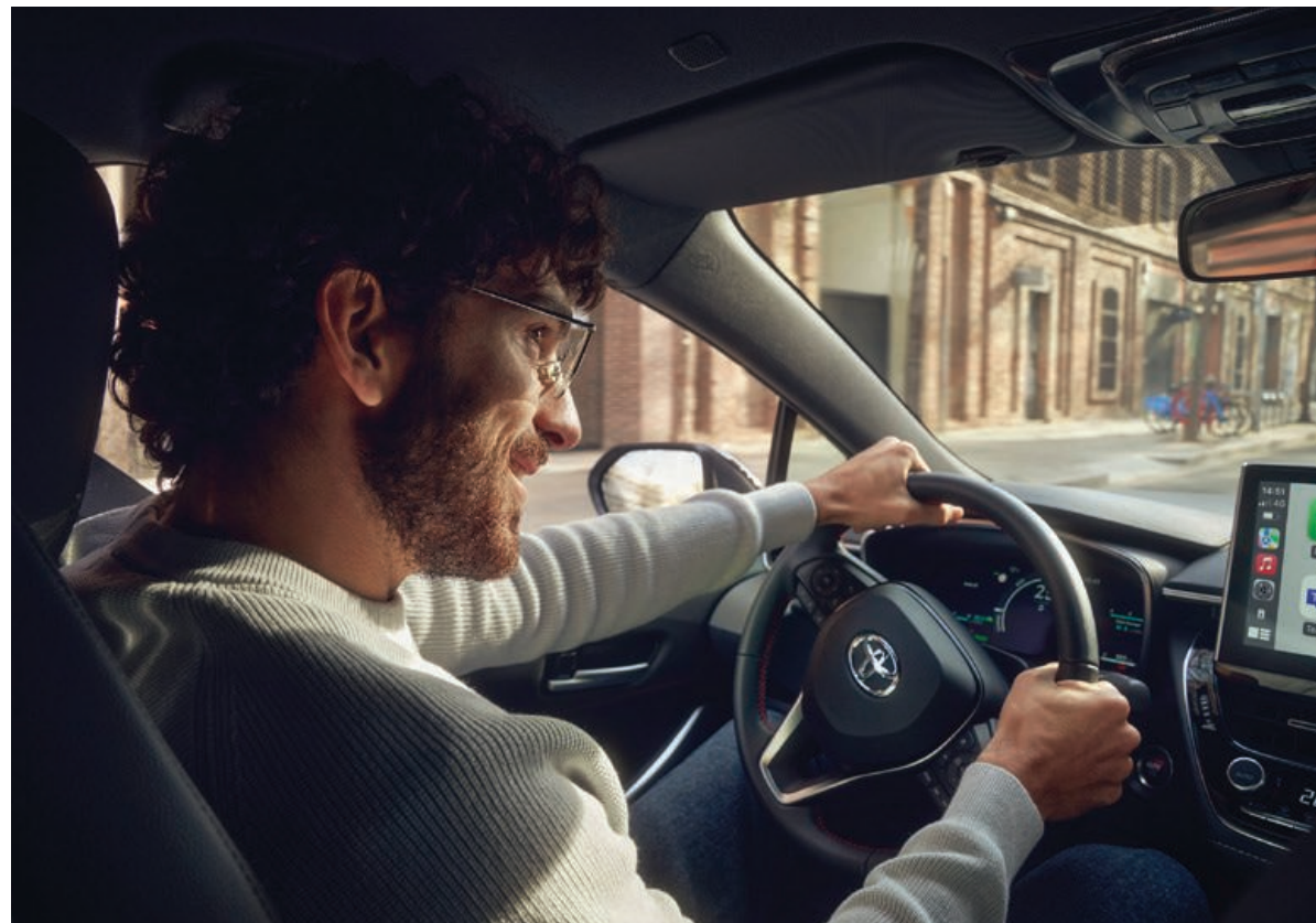
Black Fabric with Grey Stitching (Luna) Black Fabric & Synthetic Leather (Luna Sport & GR SPORT)