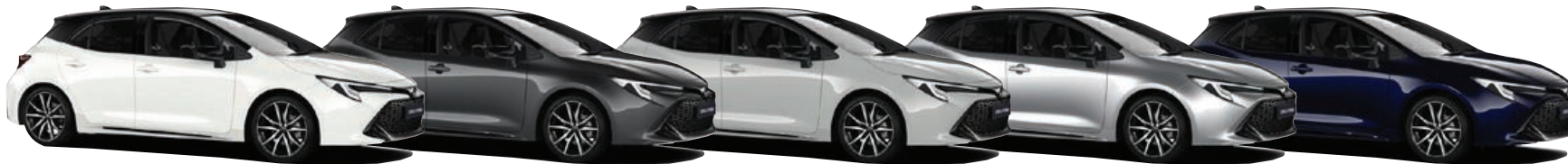
Pure White Bi-tone (2NR)