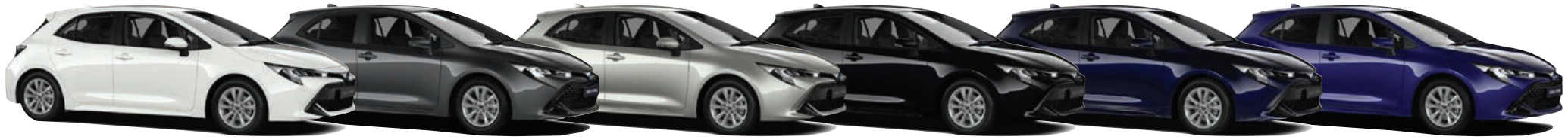
Pure White (040)